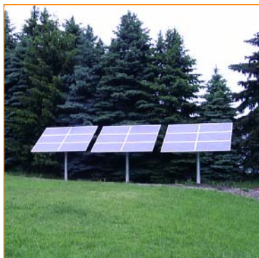
Sharp multi-purpose modules offer industry-leading performance for a variety of applications.