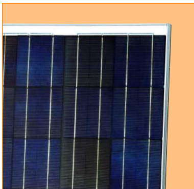
Solder-coated grid results in high fill factor performance under low light conditions.

Sharp's NE-80EJEA photovoltaic modules offer industry-leading performance, durability, and reliability for a variety of electrical power requirements. Using breakthrough technology perfected by Sharp's 45 years of research and development, these modules incorporate an advanced surface texturing process to increase light absorption and improve efficiency. Common applications include cabins, solar power stations, pumps, beacons, and lighting equipment. Designed to withstand rigorous weather conditions, a junction box is also provided for easy electrical connections in the field, making Sharp's NE-80EJEA modules the perfect combination of advanced technology and reliability.